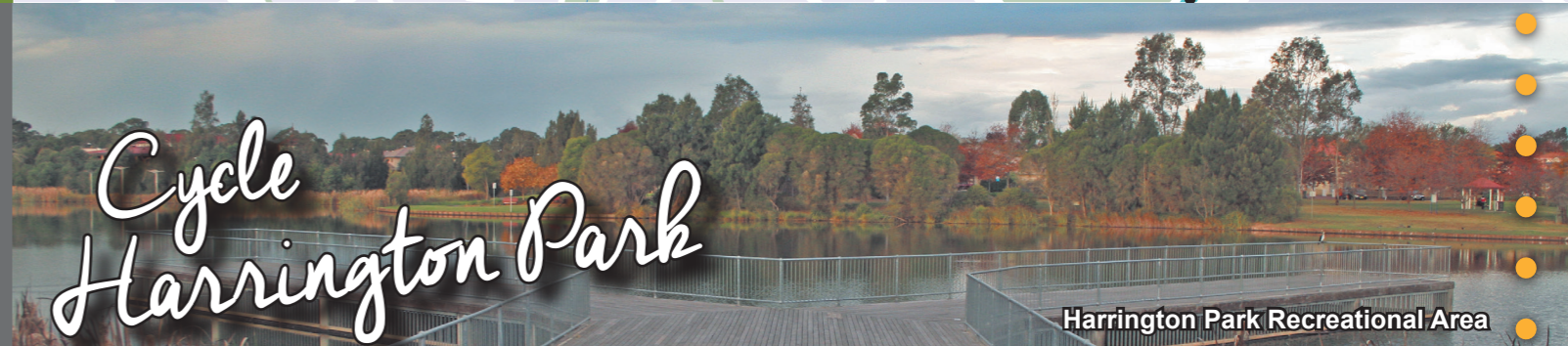
Harrington Park Recreational Area

Bring the whole family and enjoy a ride or walk around the shared path at Harrington Park Recreational Area . The picturesque Harrington Lake is a popular spot, well serviced with picnic tables, playgrounds and public amenities. Home to a wide variety of native birdlife, Harrington Park is a great place to get active with friends and family.