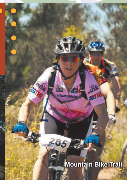
Mountain Bike Trail