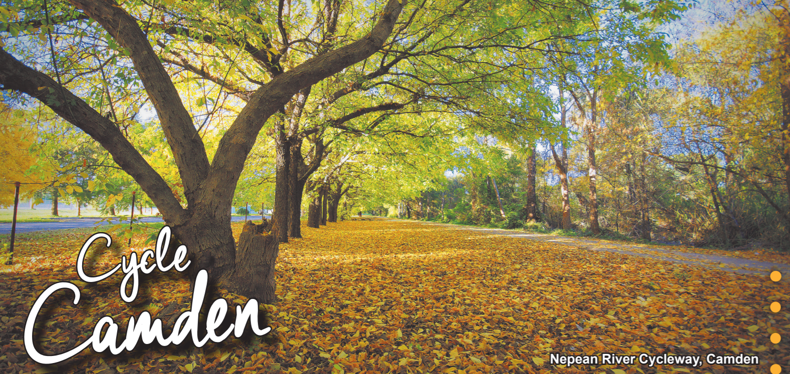
Nepean River Cycleway, Camden